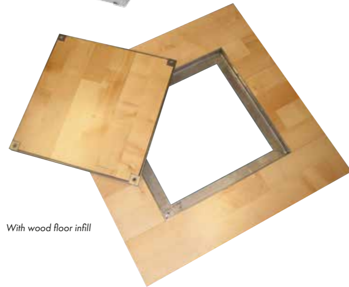
With wood floor infill

Stainless steel floor access covers for pedestrian traffic on wooden surfaces